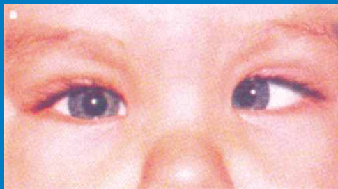
Fig. (5.b) Before Surgery