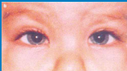
Fig. (5.c) After Surgery