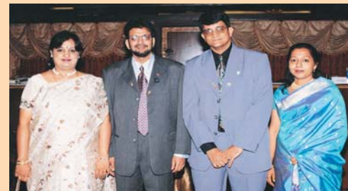
► Spectacles for employees of transport corporation.

Phacoemulsification method and taken back to the villages safely and of course, with good vision. The eye consultants and Optometrists at Rajan Eye Care who visit these villages regularly do the postoperative follow up of these patients. Free spectacles and medicines are also given to these patients.