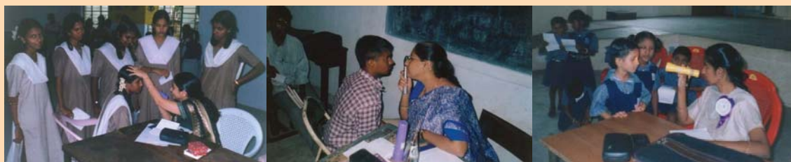
► Eye consultants of Rajan Eye Care participating in a eye camp

The rural outreach programme of Rajan Eye Care and Chennai Vision Charitable Trust has benefited several thousands of patients in the villages. The screening of the patients is usually done in their respective villages and the patients are transported to the base hospital, given good food, accommodation and operated for cataract with IOL implantation by