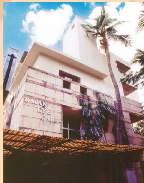
► Standing Tall - Rajan Eye Care Hospital