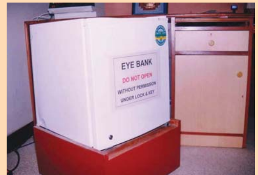
► Donor Eye Storage