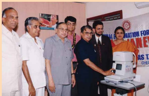
► Inauguration of new Eye Bank facilities